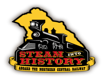
May 18th, June 15th, July 20th, August 17th 11:30 - 1:00 & 2:30