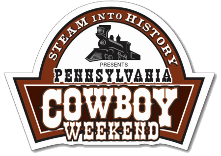
October 12th & 13th